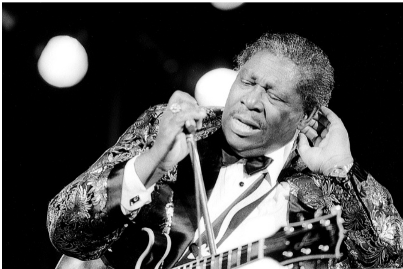
MAURIZIO GONNELLA - B.B. King, Estival Jazz Lugano, 1990