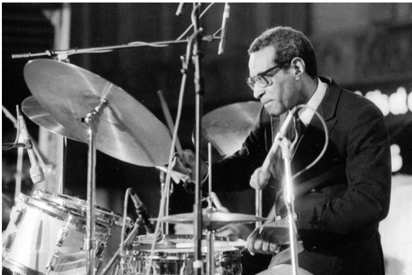
Max Roach, Estival Jazz Lugano, 1983