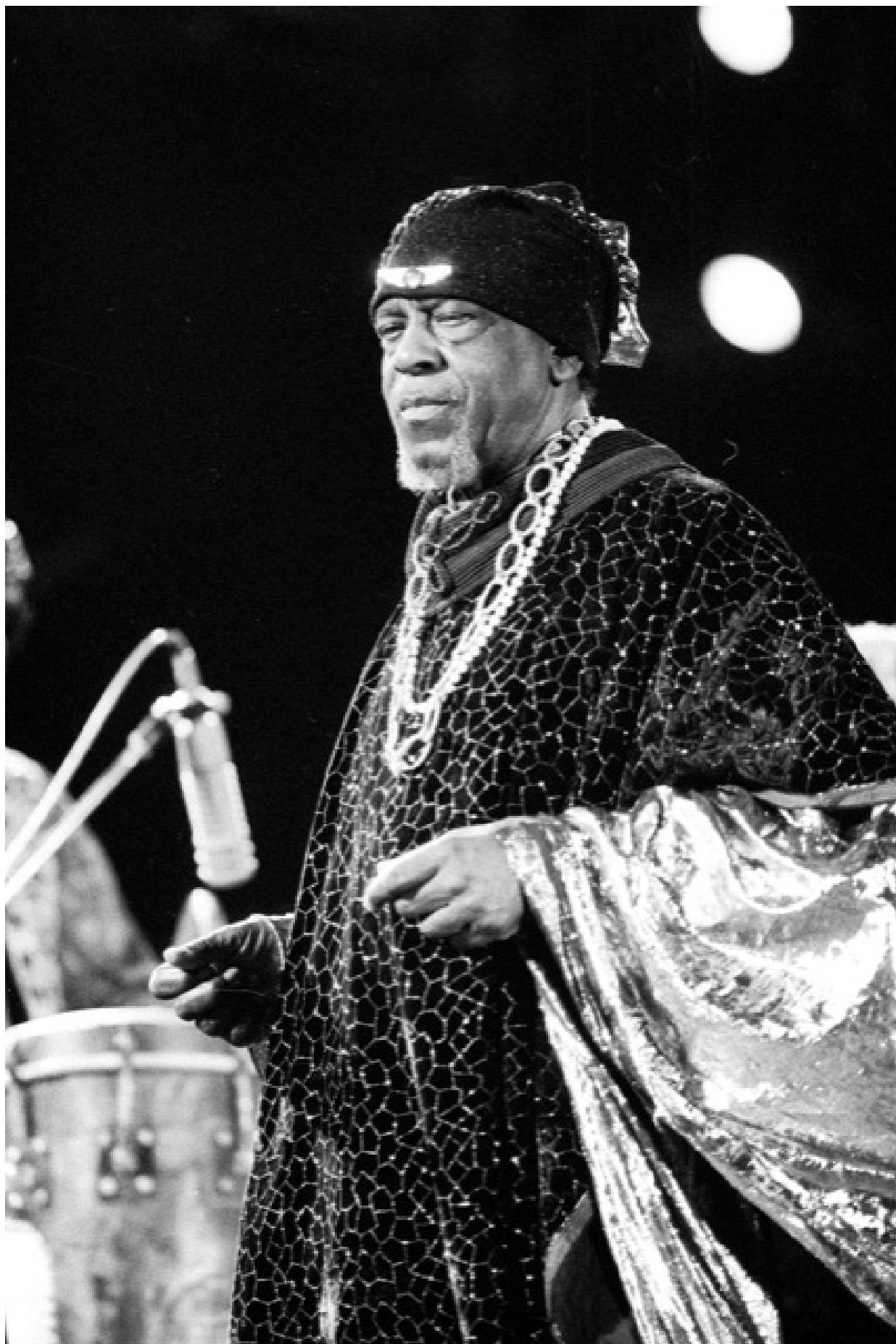
Sun Ra, Estival Jazz Lugano, 1985