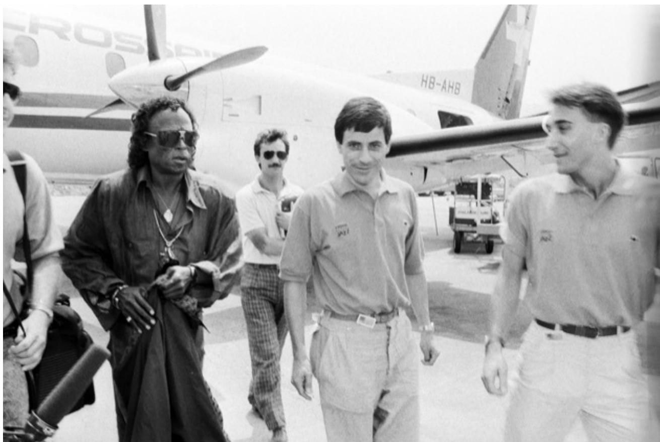
Miles Davis, Aeroporto Lugano-Agno, 1987