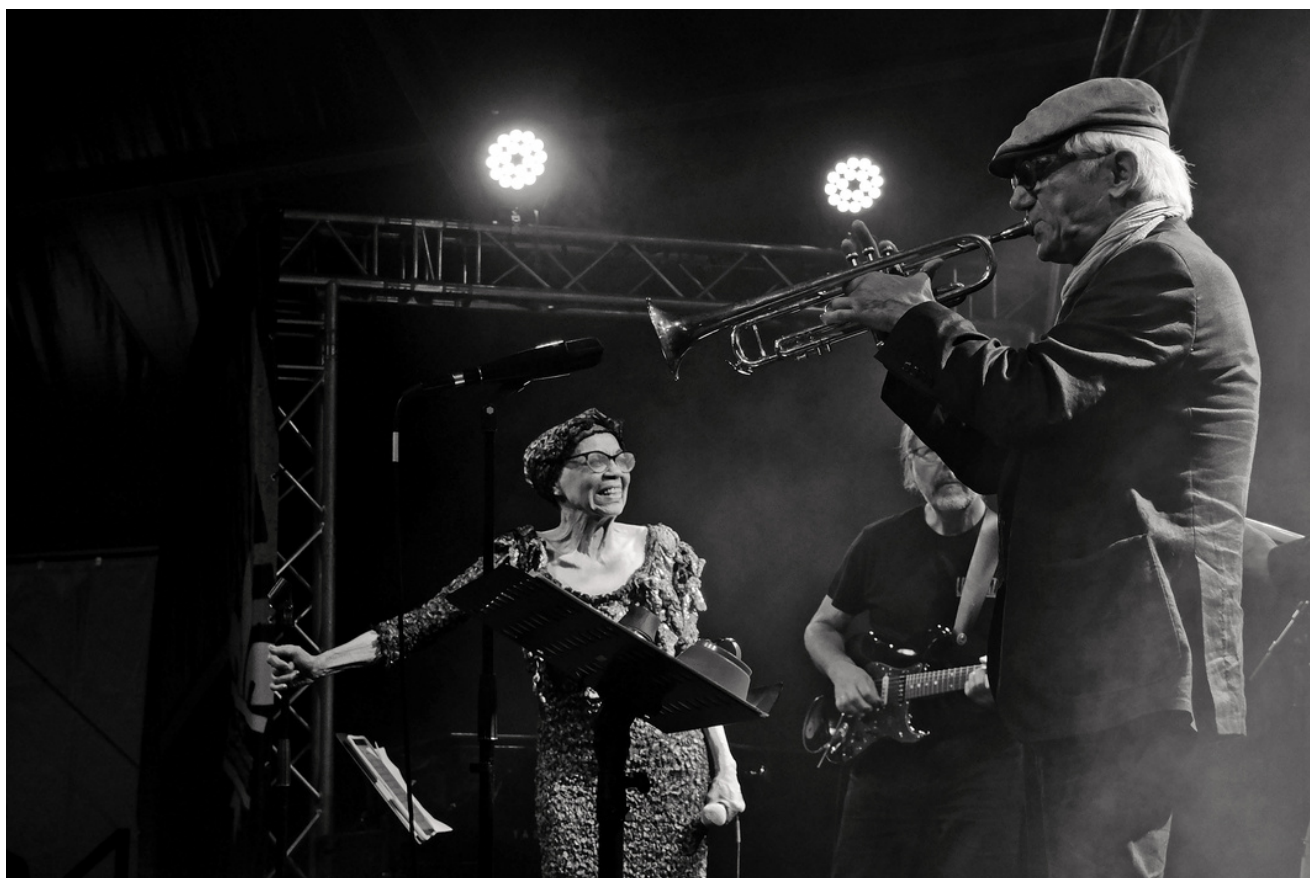
MATTEO CESCHI - Othella Dallas, JazzAscona Ascona, 2019