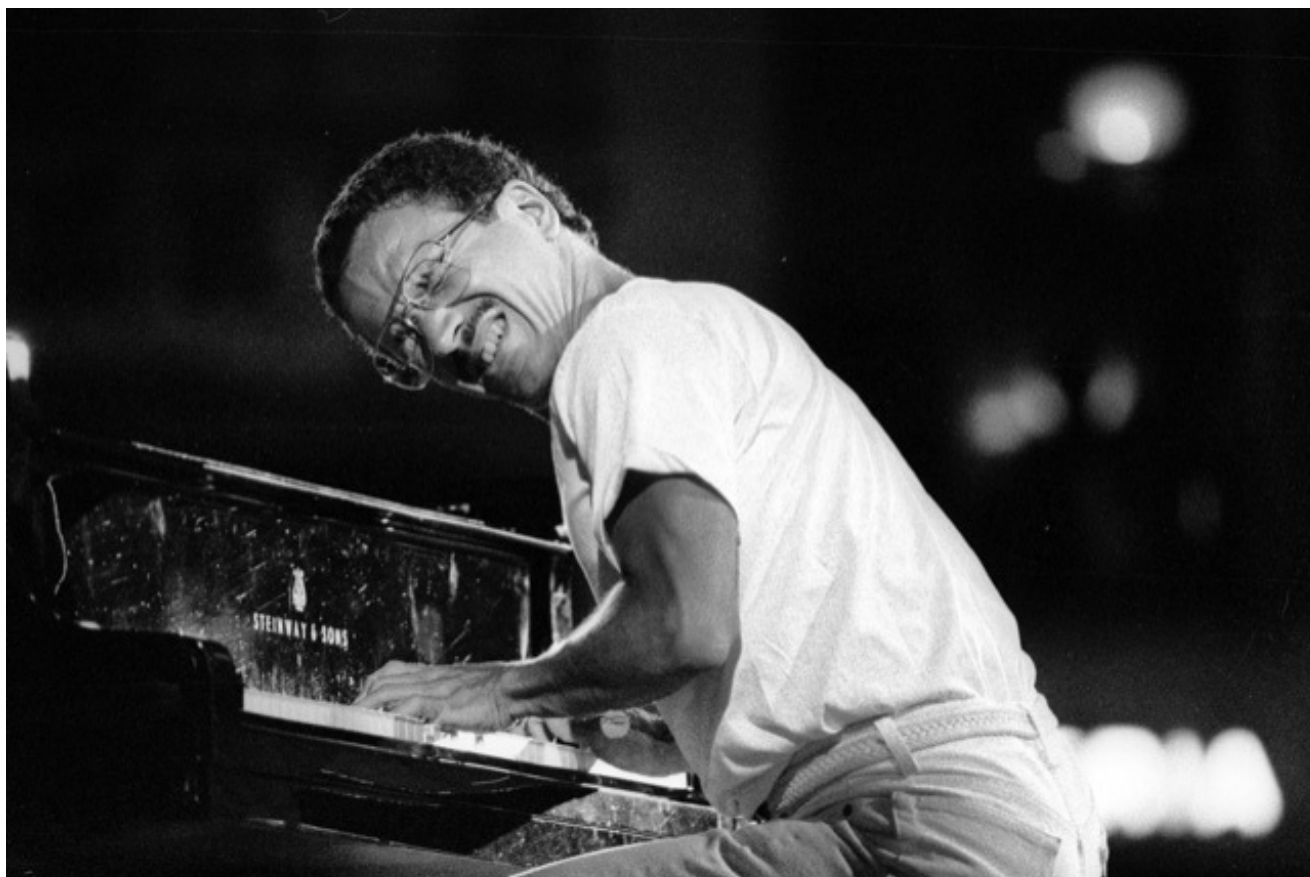
Keith Jarrett, Estival Jazz Lugano, 1986