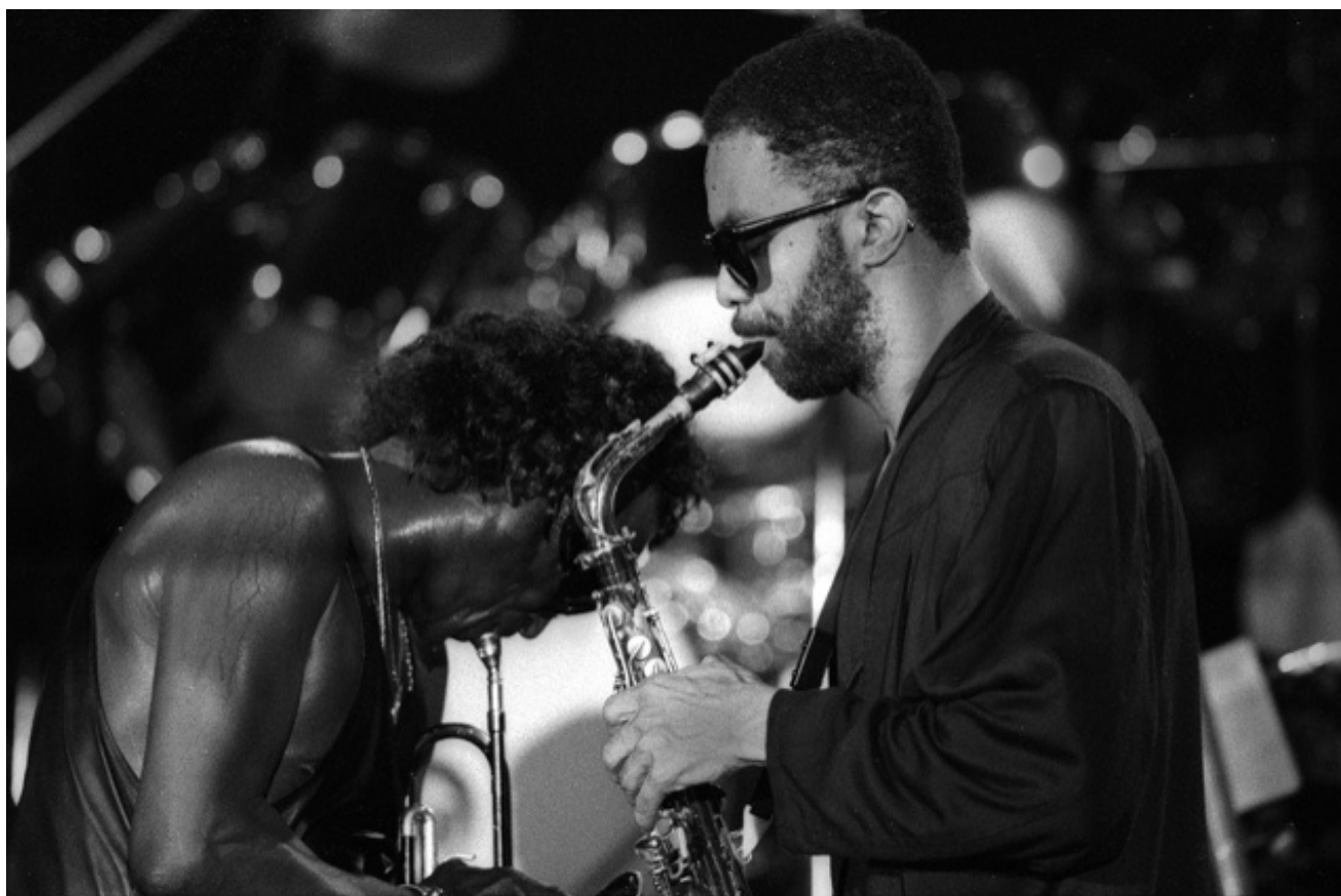
Miles Davis & Kenny Garrett, Estival Jazz Lugano, 1987