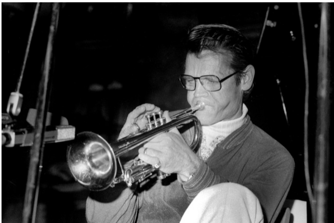
Chett Baker, Estival Jazz Lugano, 1980