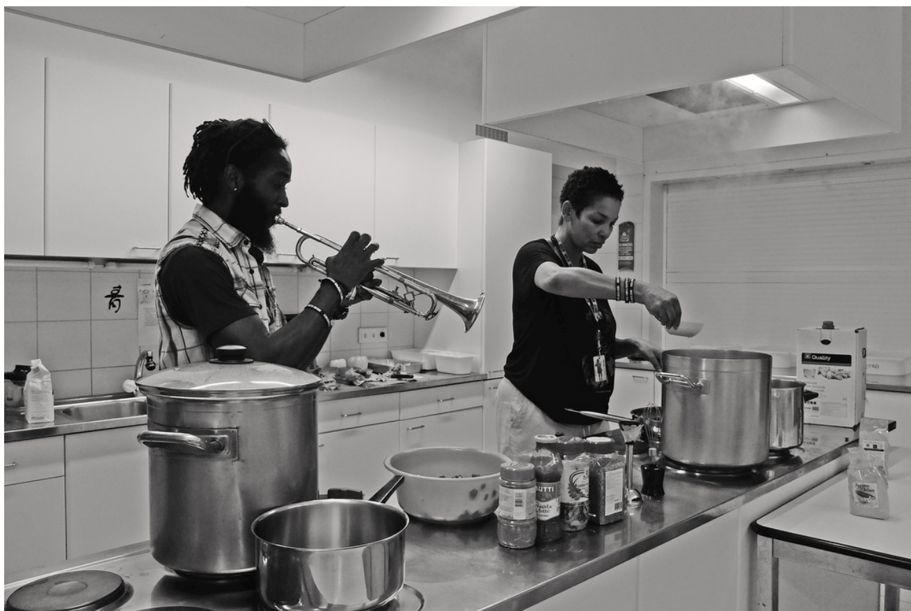
MATTEO CESCHI - Leon "Kid Chocolate" Brown, Ascona, 2020