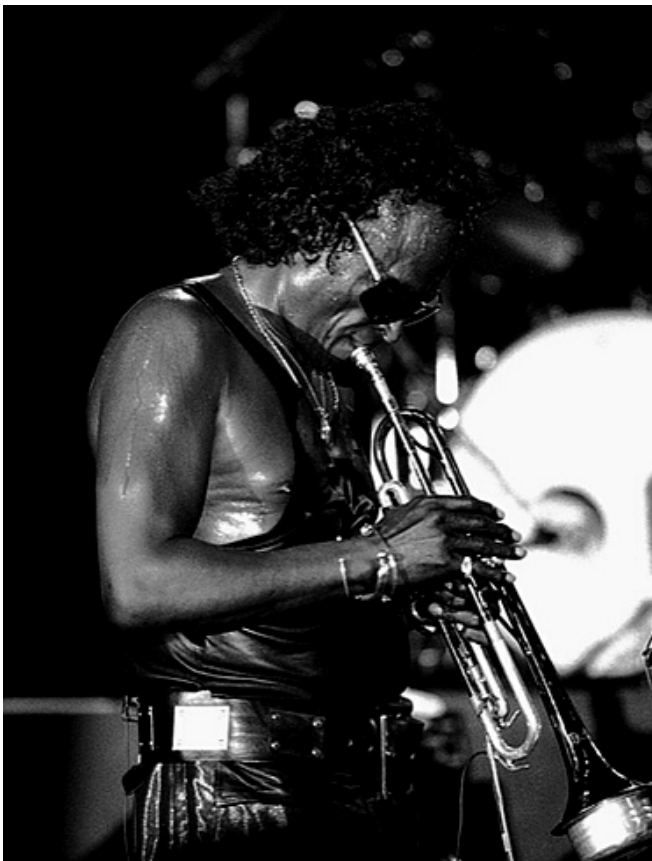
Miles Davis, Estival Jazz Lugano, 1987