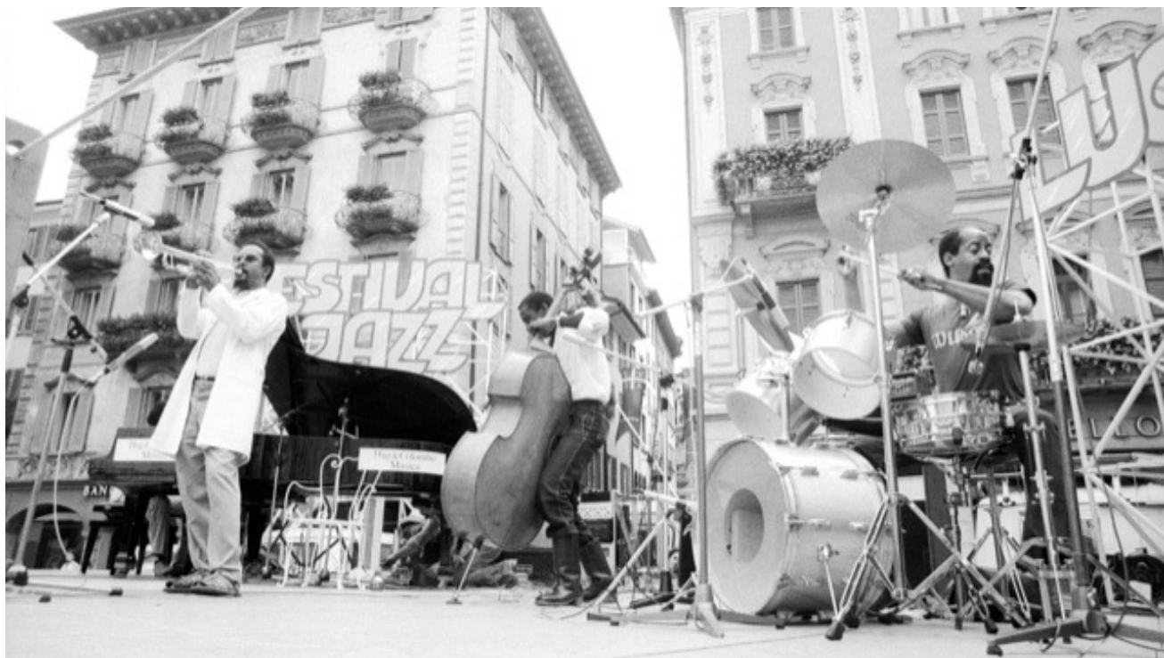
MAURIZIO GONNELLA - Art Ensemble of Chicago, Estival Jazz Lugano, 1988