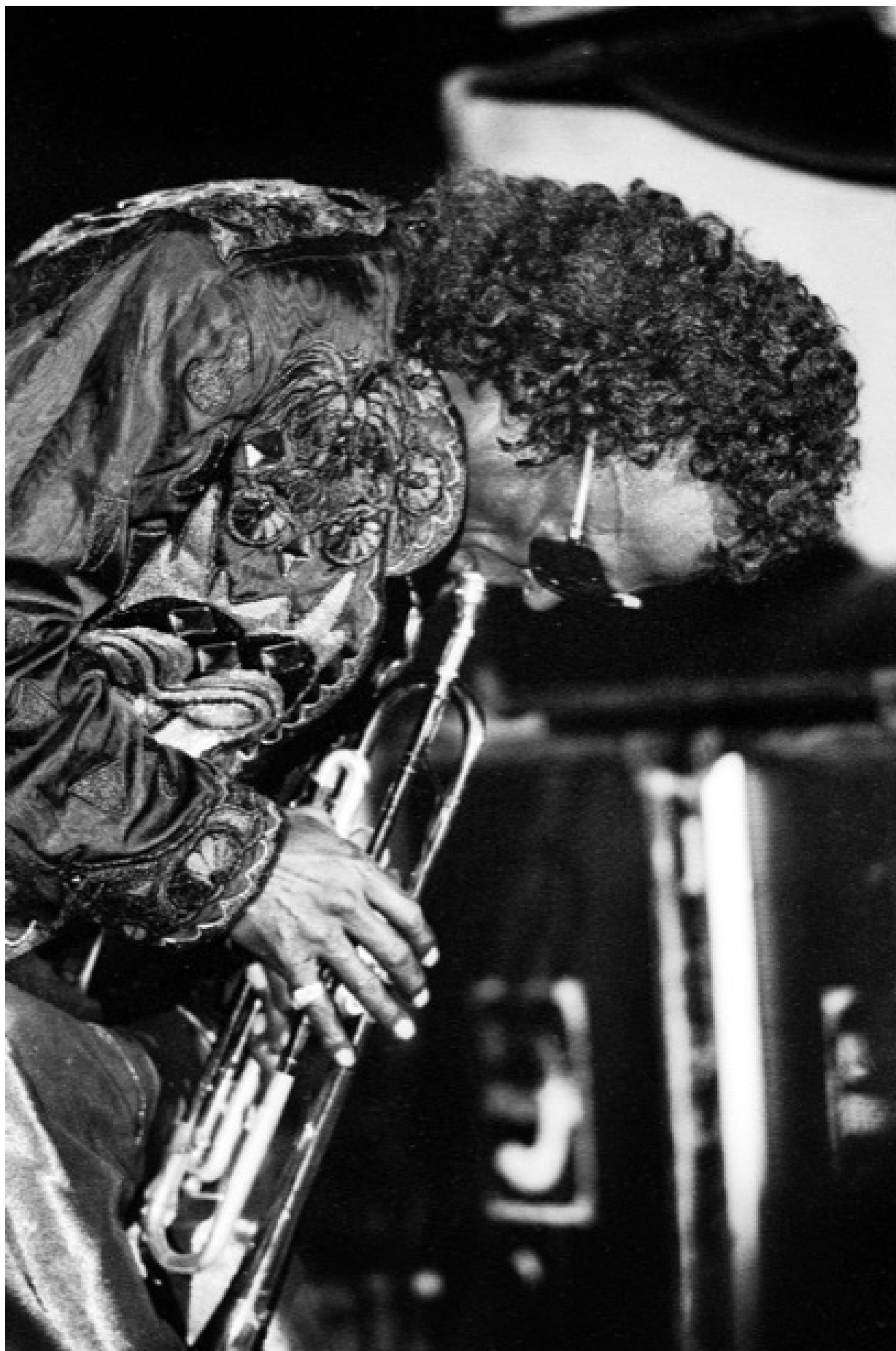
Miles Davis, Estival Jazz Lugano, 1987