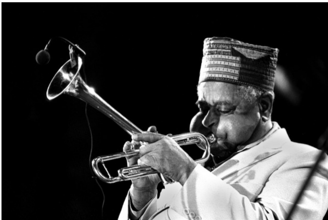
MAURIZIO GONNELLA - Dizzy Gillespie, Estival Jazz Lugano, 1990