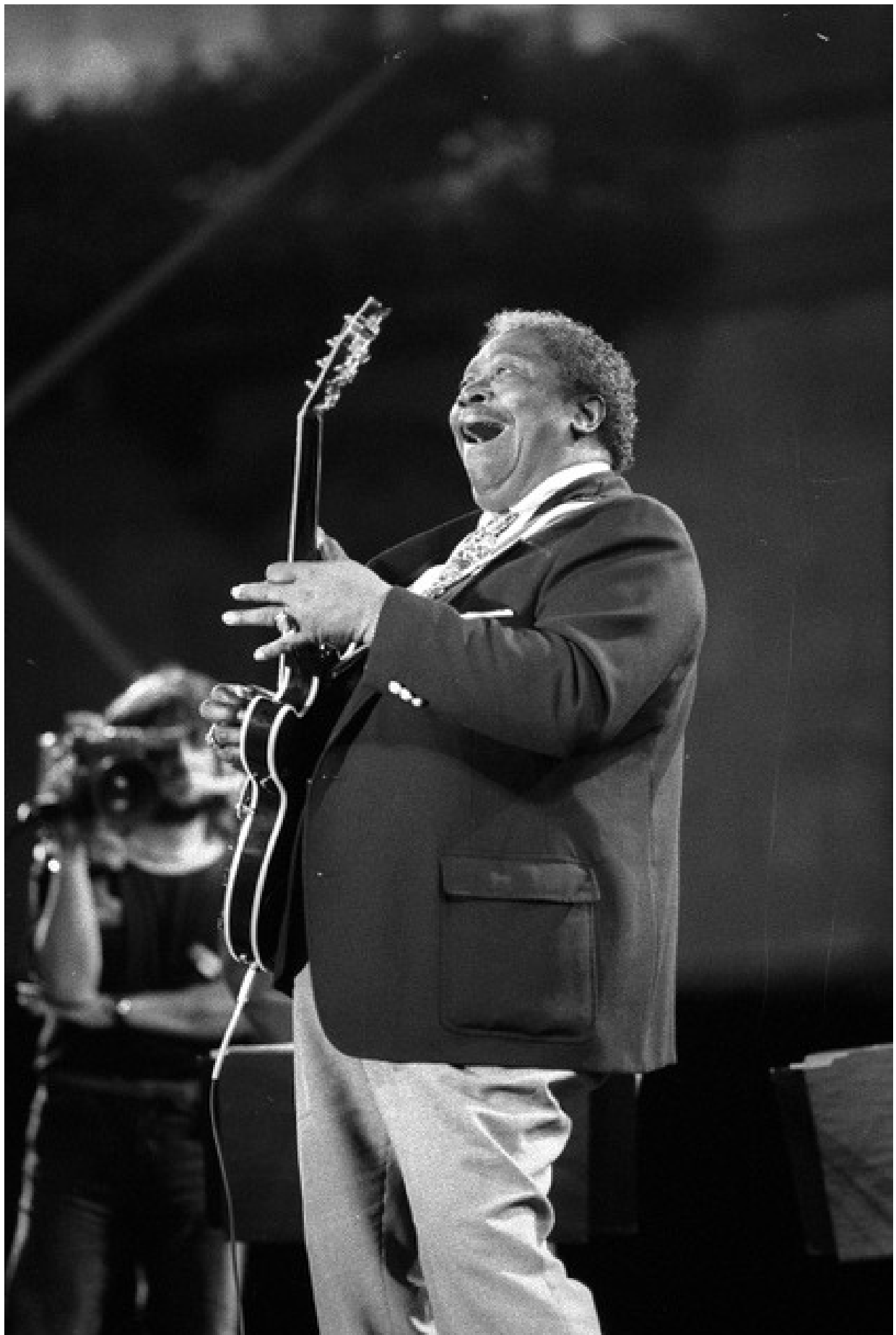
MAURIZIO GONNELLA - B.B. King, Estival Jazz Lugano, 1990