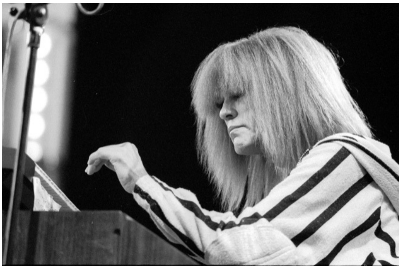
Carla Bley, Estival Jazz Lugano, 1986